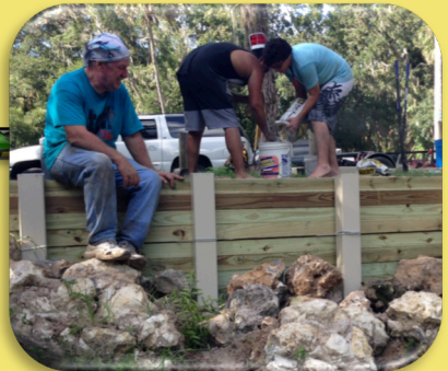
Rebuilding the sea wall at WWCC