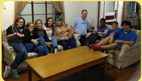
Youth movie night