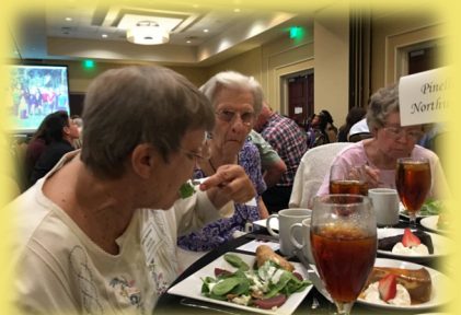
Mt. Dora Benefit dinner