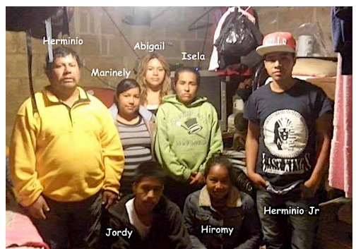
This is the family we are building for this year in Mexico.