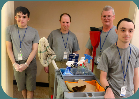
Meet the LiFT U Cleaning Crew